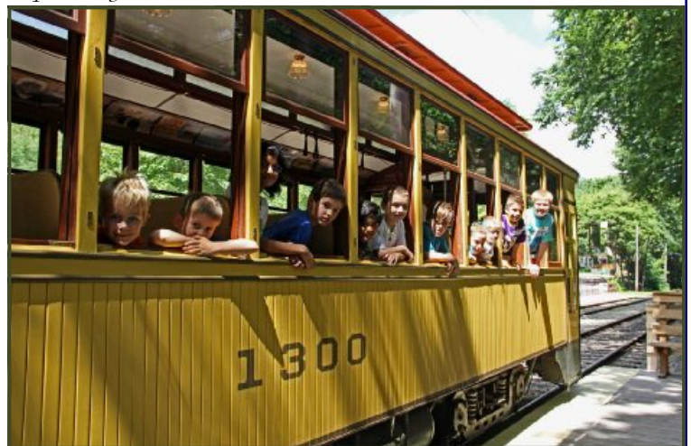
ABOVE LEFT. Here’s a future Motorman taking his job seriously. All of the campers had a chance to operate streetcar TCRT No. 1300. ABOVE RIGHT. The class photo of our 2013 Streetcar Camp graduates. There were three girls in this year’s class; a good group of kids.